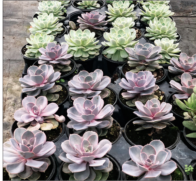
Beautiful succulents and pansies from Butler's Greenhouse.