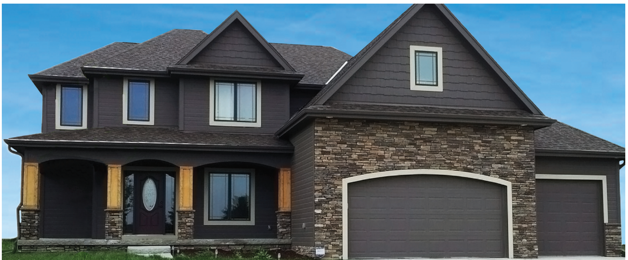
Castleberry Home Plan# 29084

Whether it's your Dream House or your FIRST HOUSE