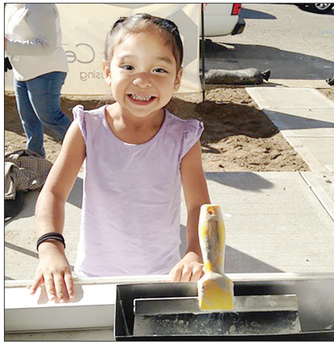
An unidentified child lends a helping hand during the 2015 build.