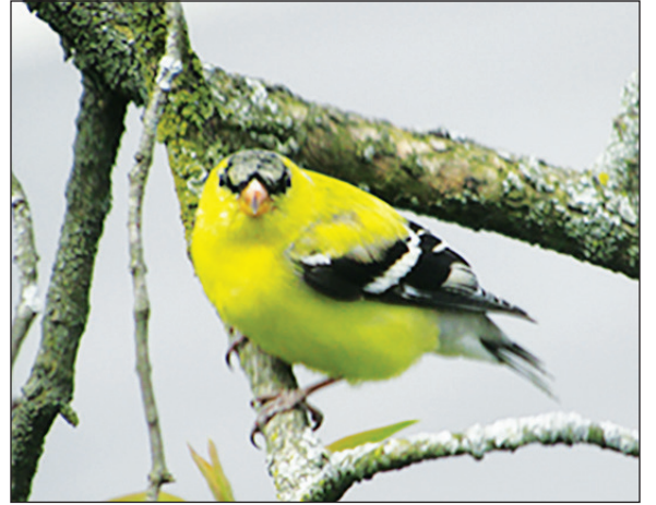
American goldfinches are a sign of spring in Indiana. The males (like the one here) are colorful in the spring and summer but lose their brilliance in the winter. The females aren't as bright.