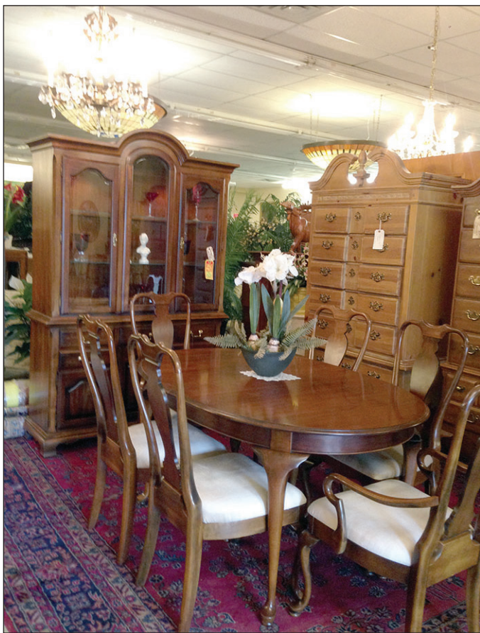
AMERICAN CRAFTSMEN USED SOLID CHERRY WOOD FROM THE UNITED STATES TO MAKE THE TELL CITY FURNITURE AT MANOR HOUSE ANTIQUE MALL, 8039 S. MERIDIAN ST. THE FURNITURE IS A TRUE AMERICAN TREASURE.