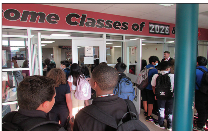
The welcome sign is out Monday morning at SMS as students enter the building.