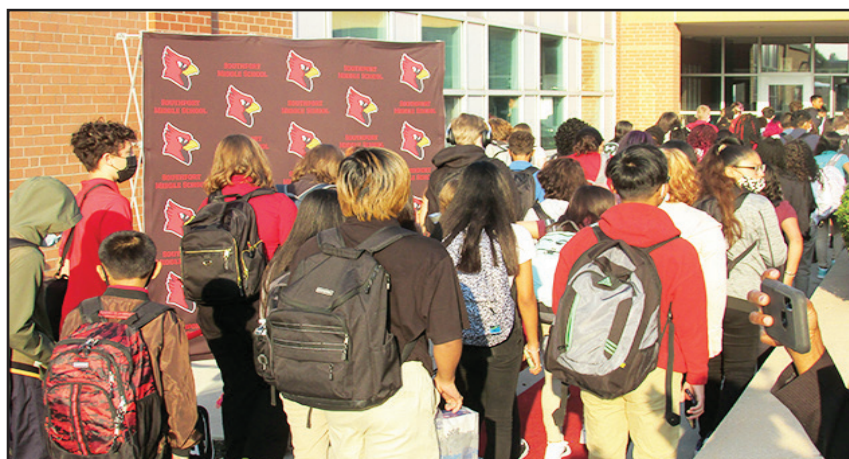
Walking on the red carpet, these SMS students with backpacks also walk past the Cardinal logos of Southport High School. Students seemed pleased to be with many friends and eager to start the new school year after coming through the Covid-19 pandemic that disrupted the 2020-2021 school year.