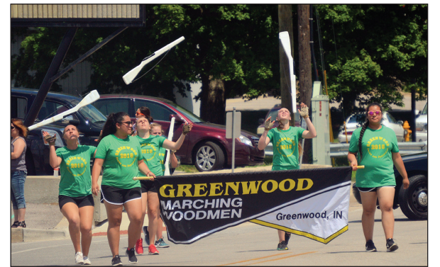
Greenwood Marching Band in last year's Freedom Festival parade.

Parade, 200 booths, live music, food, fireworks and patriotism add up to the annual Greenwood Freedom Festival in downtown Greenwood and at Craig Park. Events begin with the downtown parade at 12 noon. The parade begins at Madison Avenue and Surina Way to old Meridian Street to Broadway Street, Madison Avenue, Market Plaza and ending near Madison Avenue. Music at the Freedom Jam and KORN Country Stage begins at 2 p.m., at the amphitheater main stage at 3 p.m., and evening pre-fireworks music at 6 p.m. Special KidZone. Vendors with food, beer and wine. The Greenwood Fire Department Honor Guard plays taps and presents the American flag. KORN Country musical fireworks conclude the celebration. Info: www.greenwood.in.gov.