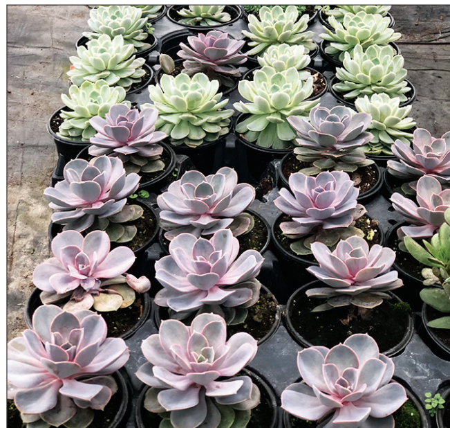
Beautiful succulents and pansies from Butler's Greenhouse.