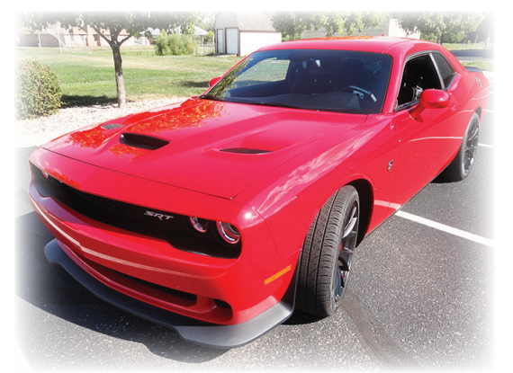
Story and pictures, see Page 13