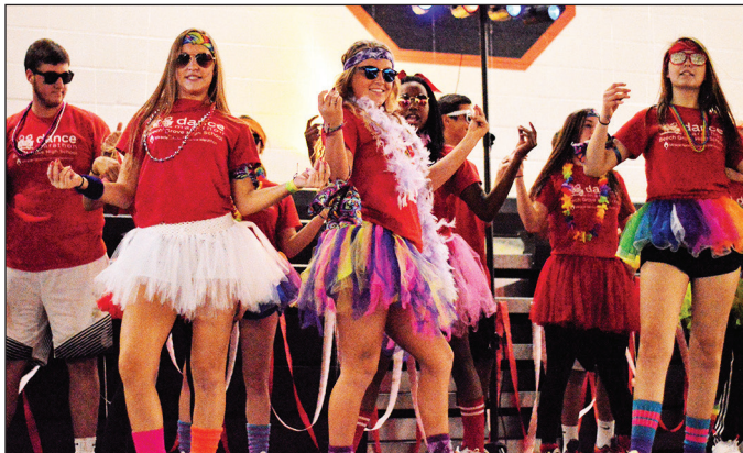
The Beech Grove Student Leadership Team performs at its inaugural dance marathon, which raised more than $9,000 for Riley Hospital for Children at IU Health.