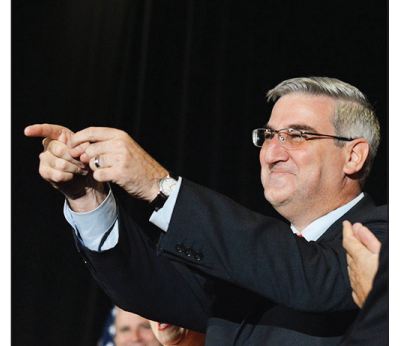
Eric Holcomb celebrates with supporters after winning the gubernatorial election.