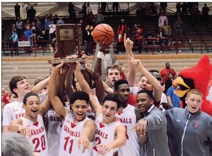
Southport basketball players celebrate a regional championship.