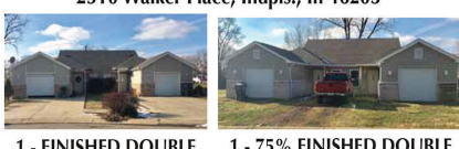
1 - FINISHED DOUBLE 1 - 75% FINISHED DOUBLE

11 LOTS ZONED MULTI FAMILY "ESTATE OF ANTHONY SPEZIALE SR." 2510 Walker Place, Indpls., In 46203