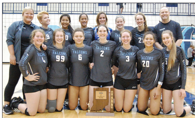
Perry Meridian won its fourth straight sectional crown and 21st overall.

The 4A winners advance to Saturday's Columbus East Semistate; the Class A victors travel to Loogootee.