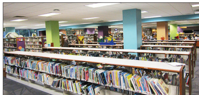
Colorful pillars enhance the children's area at the library. The first floor features a quiet play area and various rooms for activities.

Dobbs' premise for the library is simple: Reading is transformative. Reading particularly at an early age transforms children into becoming better students, turns adults into better workers and opens doors to those who are learning English as their primary