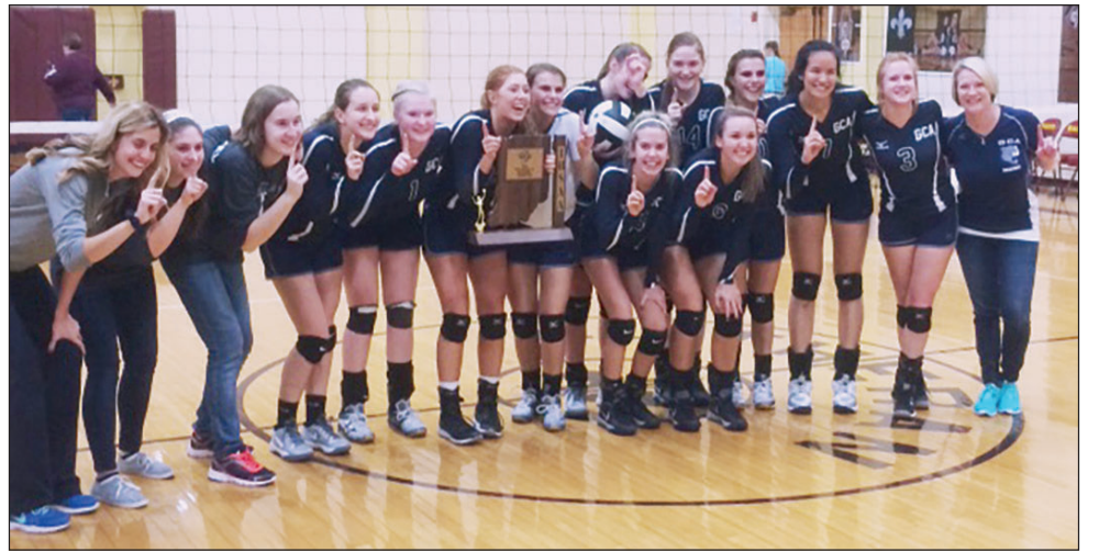
Greenwood Christian Academy won its first sectional title by defeating Lutheran.