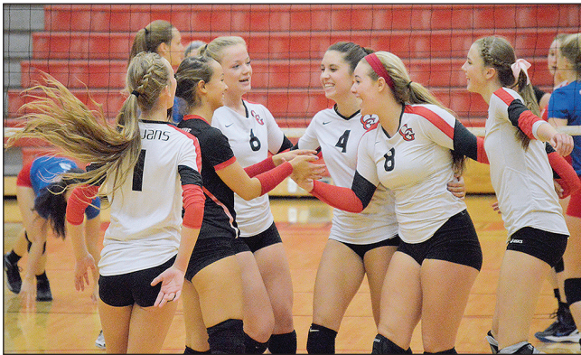
Center Grove won Sectional 13 in Greenwood with wins over Franklin Central, Martinsville and Franklin.