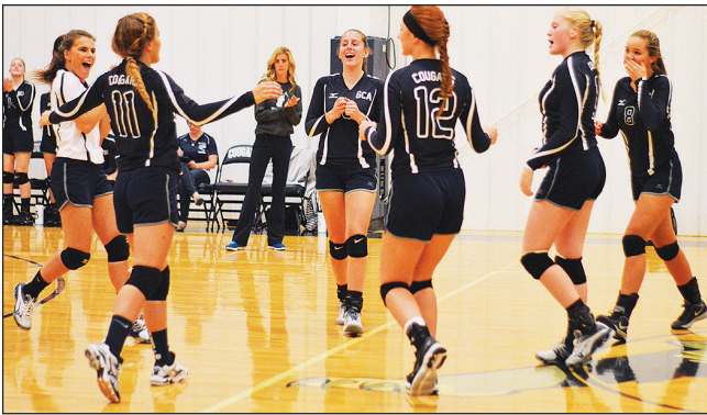
Greenwood Christian Academy upset host Lutheran in five sets.