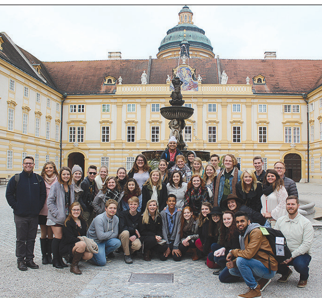
The choirs in front of the Melk Abbey in Austria, where they performed an impromptu concert.

Students and their families helped finance the trip's cost through fundraising over the past three years.