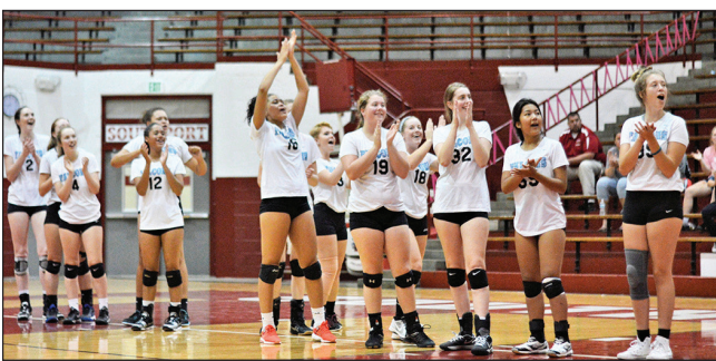
Perry Meridian defeated Roncalli and Brebeuf Jesuit to win Sectional 11.