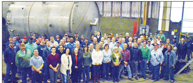
The Kennedy Tank crew

One of Kennedy Tank's unique assets is its diversity of products and services. From standard tanks to specially fabricated storage and process tanks to pressure vessels and huge columns that may stand 200-plus feet tall and weigh more than 200,000 pounds, Kennedy Tank has the answers to "big" problems.