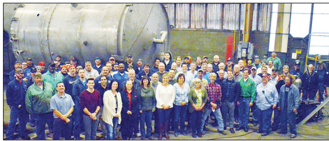
The Kennedy Tank crew

One of Kennedy Tank's unique assets is its diversity of products and services. From standard tanks to specially fabricated storage and process tanks to pressure vessels and huge columns that may stand 200-plus feet tall and weigh more than 200,000 pounds, Kennedy Tank has the answers to "big" problems.