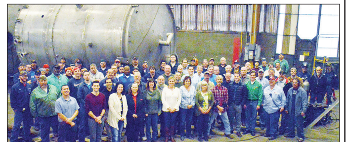
The Kennedy Tank crew

One of Kennedy Tank's unique assets is its diversity of products and services. From standard tanks to specially fabricated storage and process tanks to pressure vessels and huge columns that may stand 200-plus feet tall and weigh more than 200,000s pounds, Kennedy Tank has the answers to “big” problems.