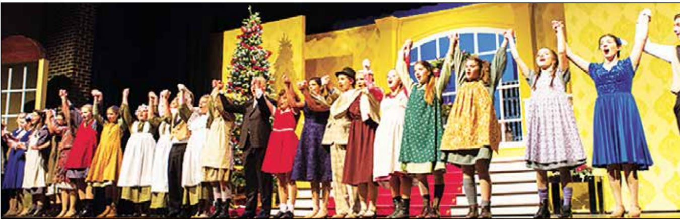
Roncalli's cast of "Annie" received a standing ovation.

3300 Prague Road • 317-787-8277 • www.roncalli.org