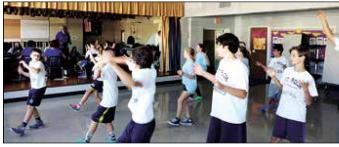
The Bollywood and drumming classes united to perform during the arts for learning block.