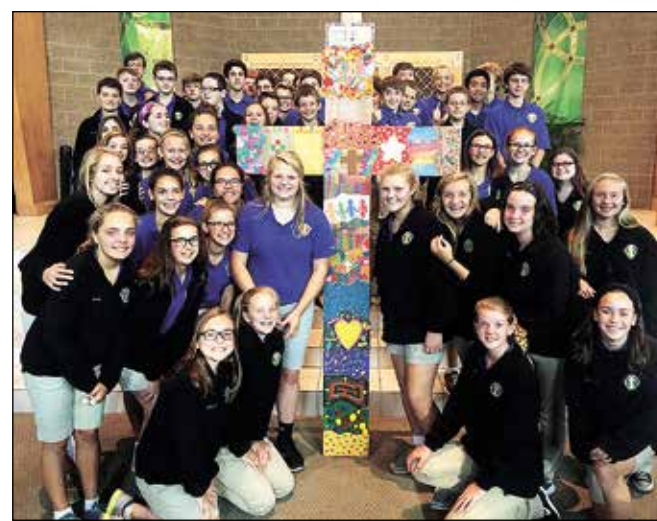
St. Jude eighth-graders are seen with a cross created by the entire school.