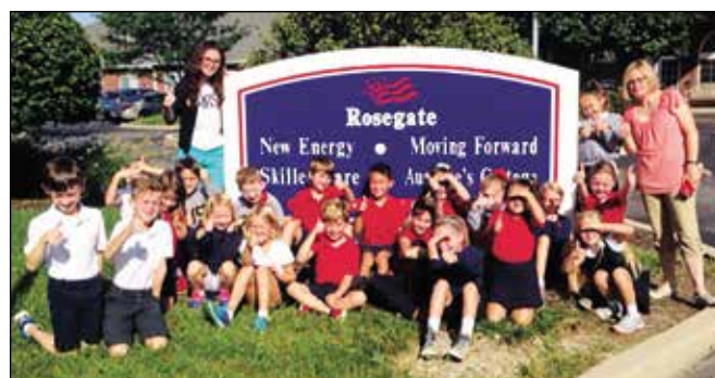
Second-graders posed for a picture before delivering flowers to residents at Rosegate Assisted Living and Garden Homes.