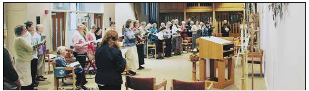
Sisters at Our Lady of Grace Monastery pray together three times daily.