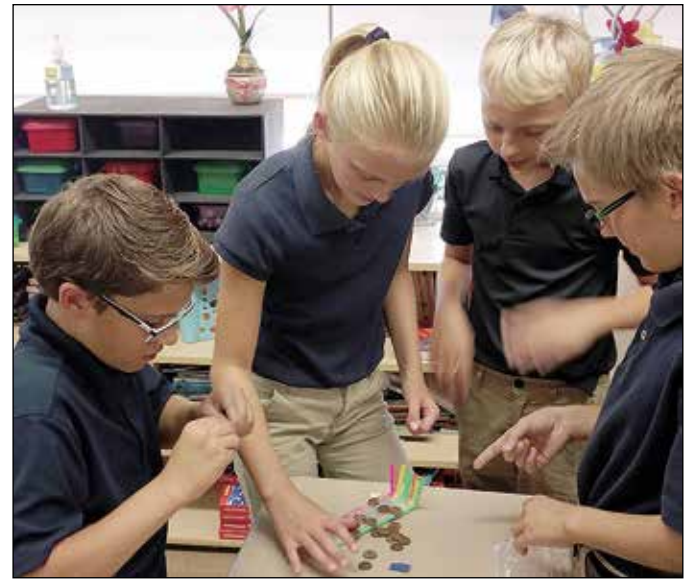
Fifth-graders perform science experiments.