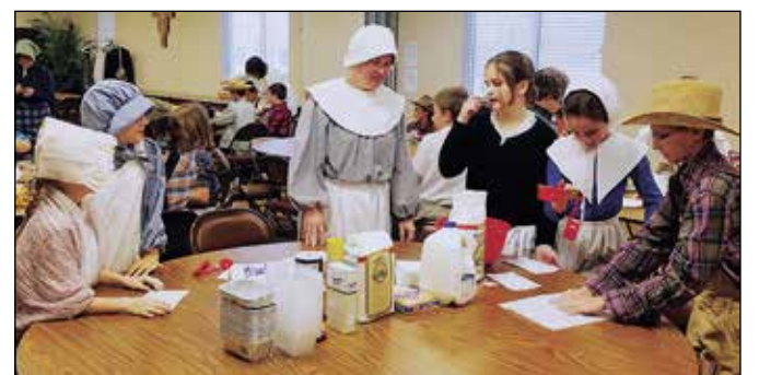
Pioneer day is celebrated at Holy Name.