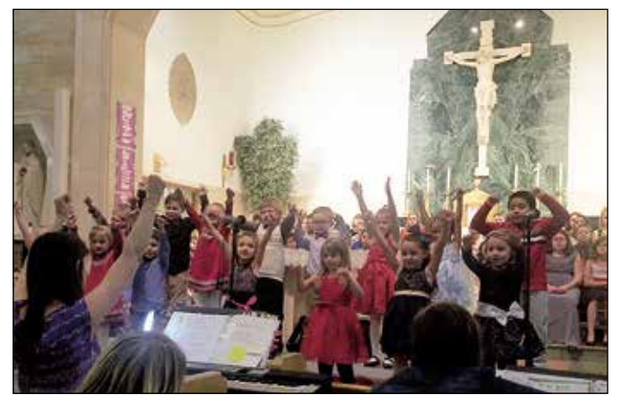
Holy Name's annual Christmas Concert is steeped in tradition.