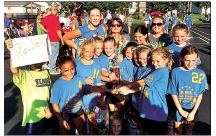
St. Roch's third-grade kickball team won the city championship.