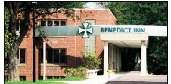
Benedict Inn Retreat & Conference Center.