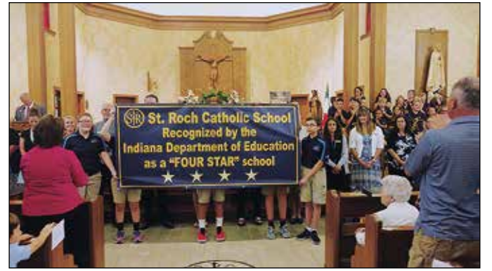
St. Roch was named a Four Star School by the Indiana Department of Education in 2015. The banner was rolled out during Grandparent's Day in 2016.